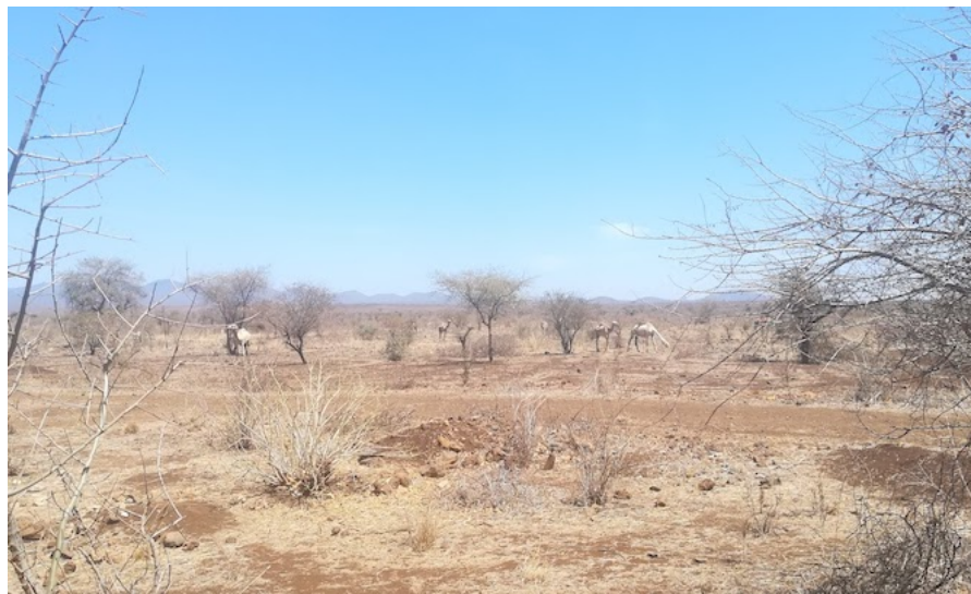
Figure 2: Camels browsing in a typical landscape in Isiolo county.

requires large rangelands, and forms a large part of the economy in Isiolo that involves many people directly or indirectly.